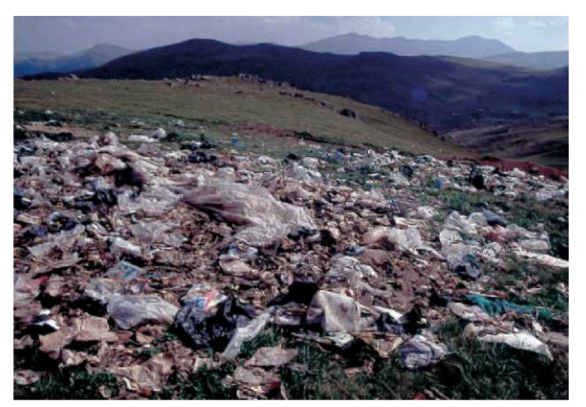
FIGURE 4 Litter remaining after the festival: a heavy burden on the environment.

demand for local tourism activities, highland festivals began to attract intense interest. Highland festivals, held by a limited number of local people who walk from their villages to perform traditional dances, now attract tens of thousands people who travel for great distances, from different cities and countries. As a result, thousands of vehicles pile into the festival spaces (Figure 3). Damage done by people and vehicles surpassing the local carrying capacity in a single day is immense. Overcrowding, noise, exhaust emissions, littering (Figure 4), provisional tents and prefabricated huts set up for a day exert too much pressure on the ground, damage the local flora, and disturb local wildlife.